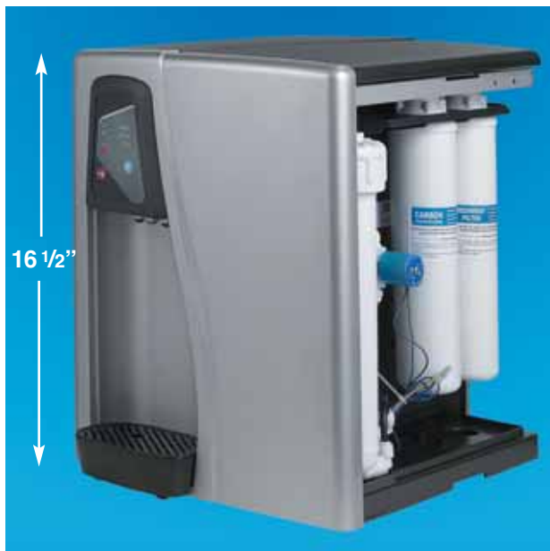
Side panel removes for easy access to filters